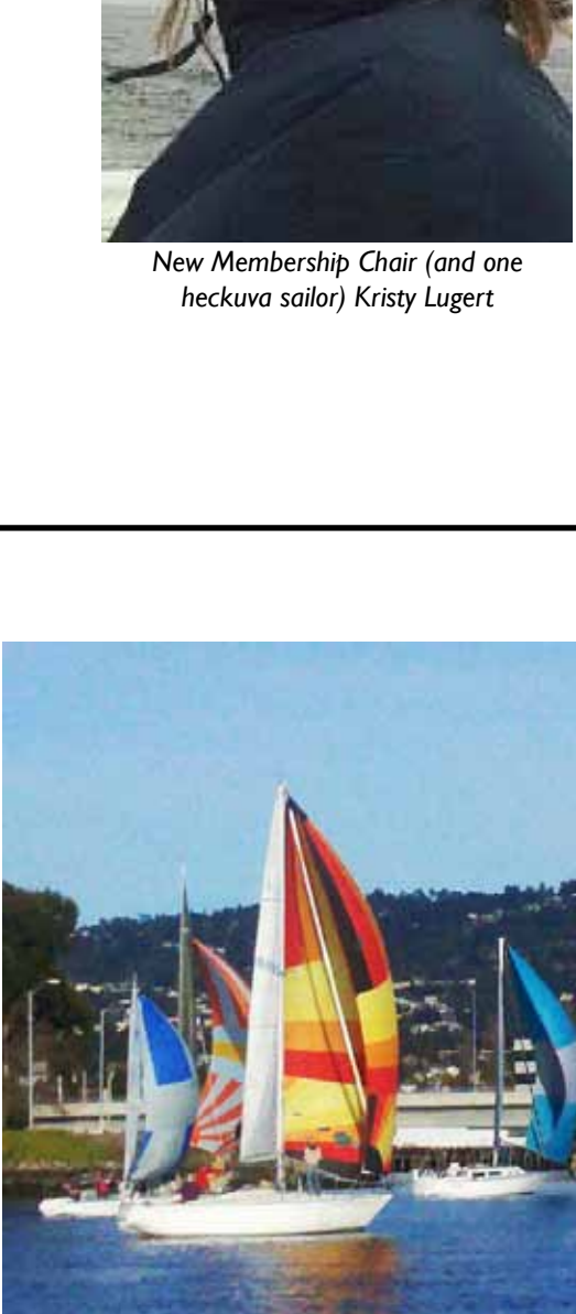
DID YOU KNOW this year is the 75th Anniversary of our Golden Gate Bridge? Lots of great stories and photos (and you can share your own) at http://www.goldengatebridge75.org/