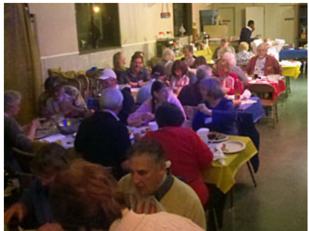
Get your bib on! Crab Feed 2011