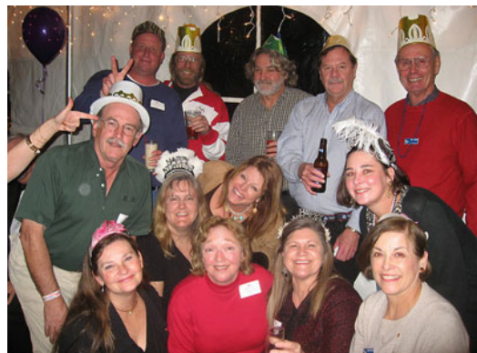
The IYC party crowd at Alameda Yacht Club