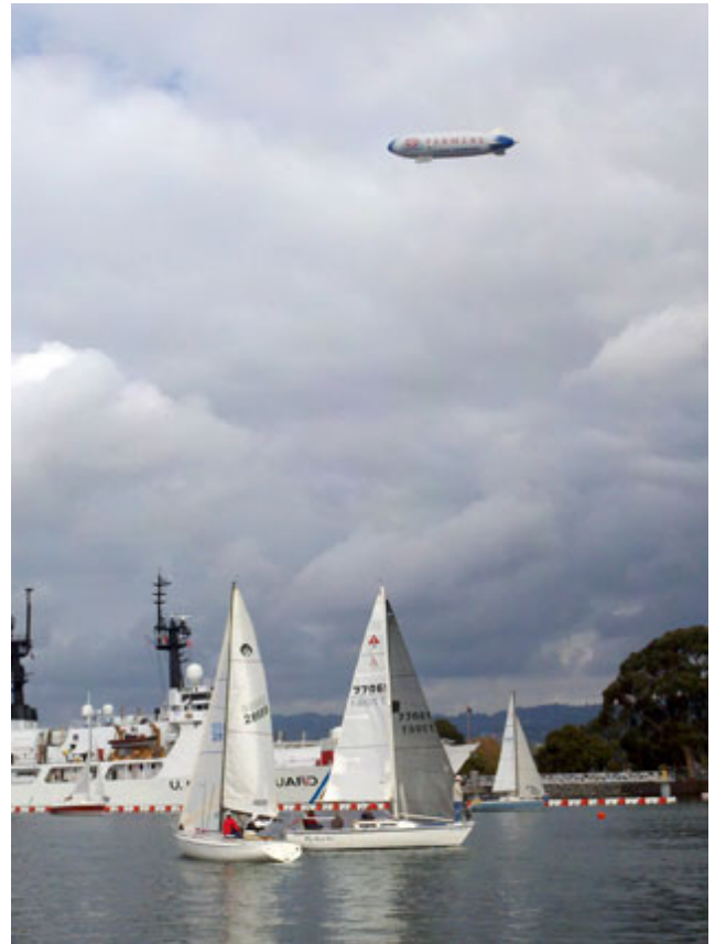
Island Days racers provide some nice photo ops for folks riding in the airship