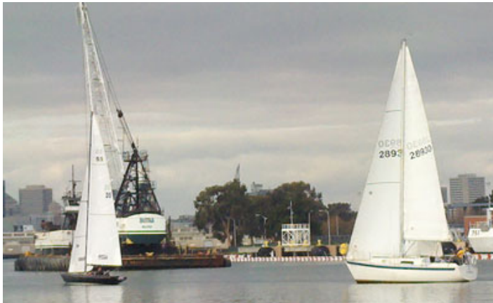
Sometimes we just have to share the water with great big barges