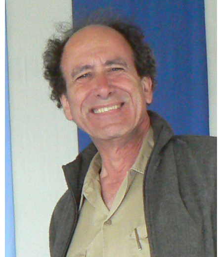
Your newsletter Editor and 2012 Staff Commodore