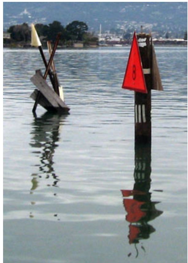
There are some strange-looking markers out there in San Leandro Channel