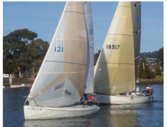
Audacious trails Snafu approaching the line, but somehow pulls ahead and finishes 1 second ahead in actual time. A great finish for those two Division A boats!