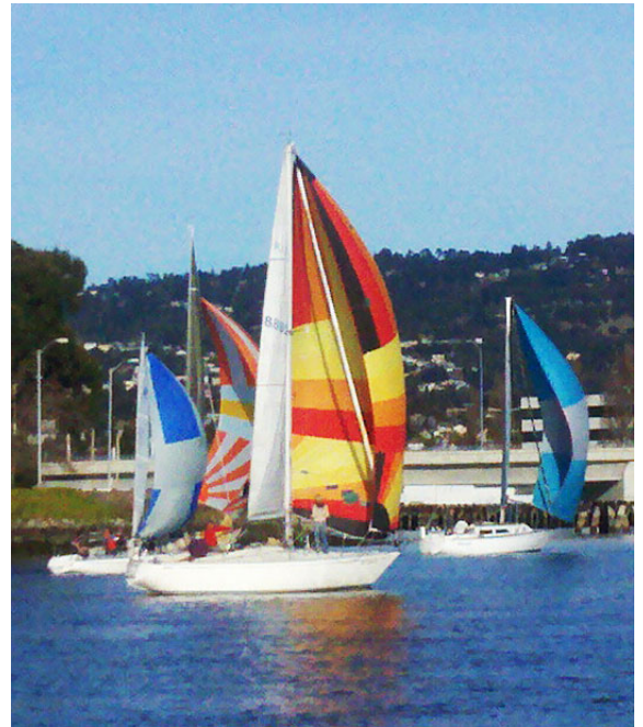
Spinnakers were flying in both directions on Sunday. Is that a pretty sight or what?