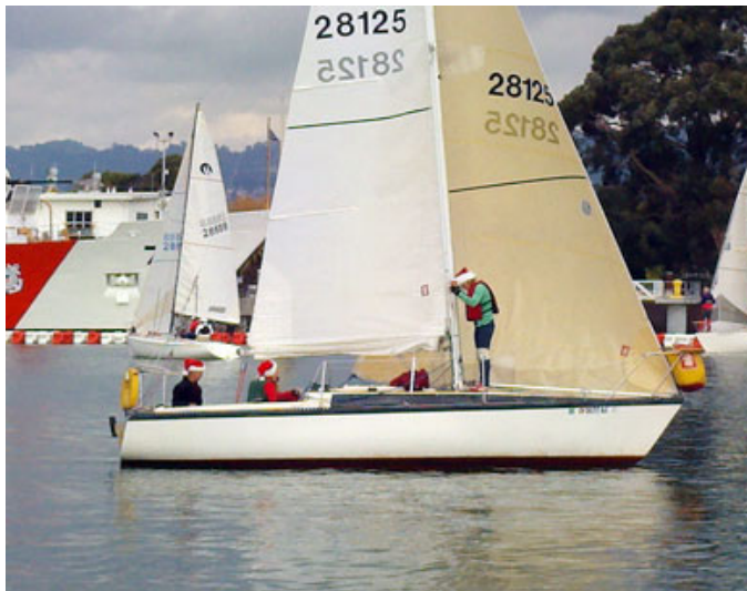
Two weeks before Christmas and this crew is dressed the part!